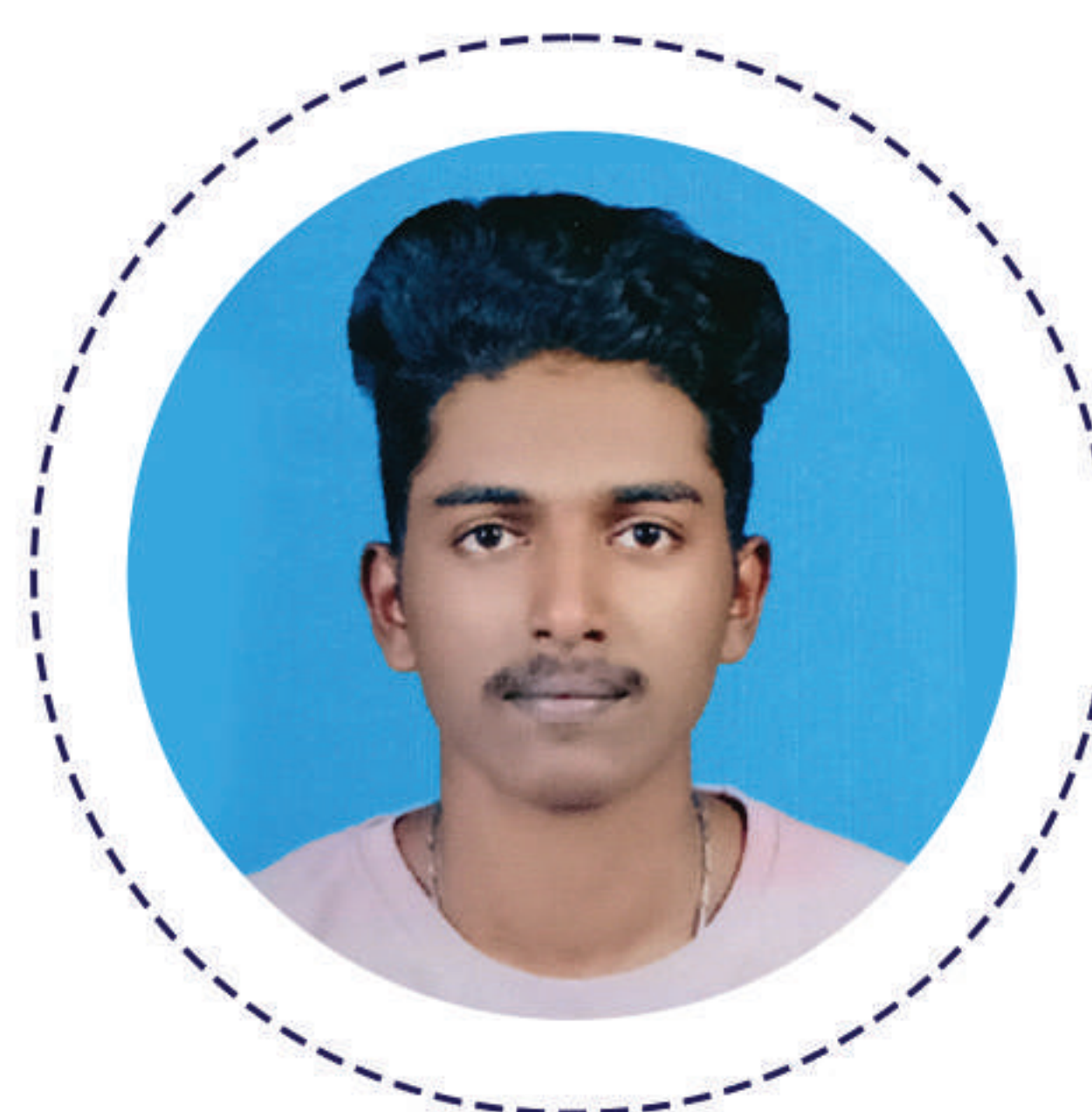
Saidali Zomato Warehouse Chennai