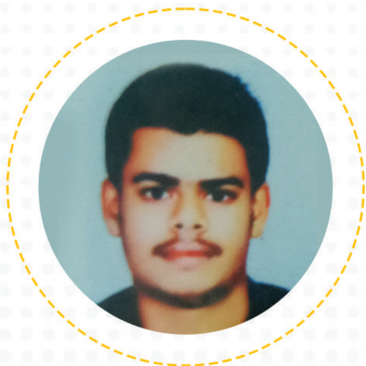
Pranav Zomato Warehouse Chennai