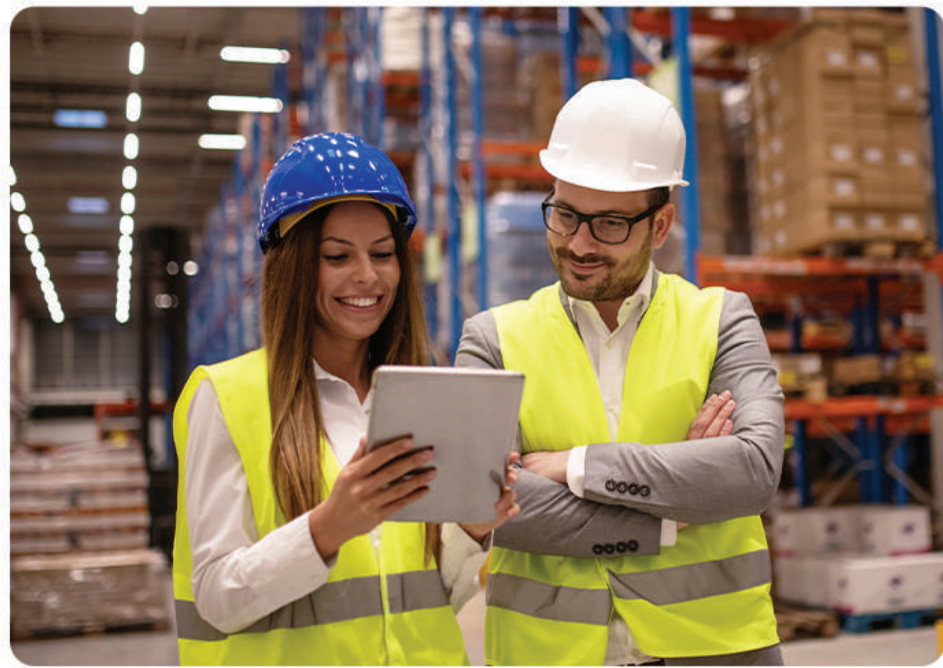
Logistics Coordinator/ Manager