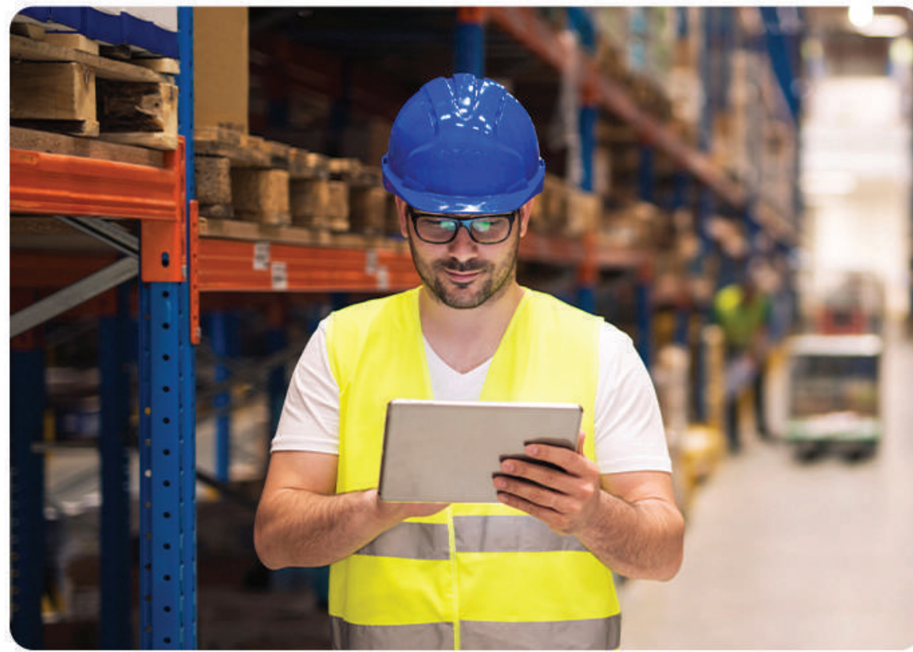
Supply Chain Analyst