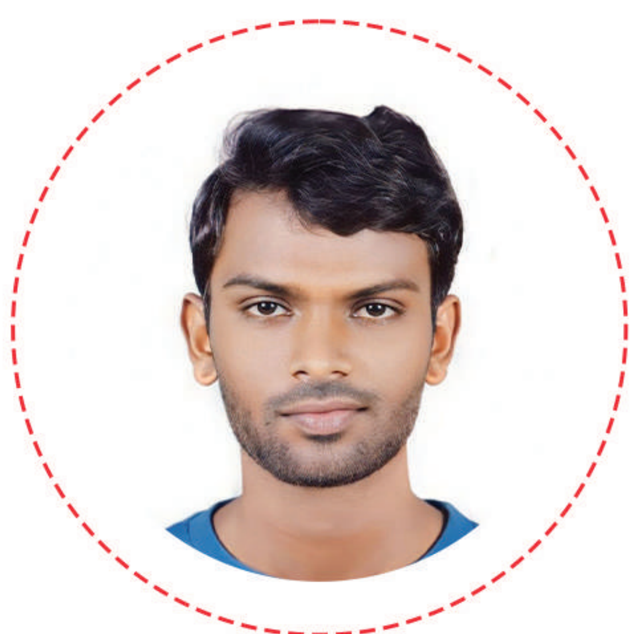
Abimale K Zomato Warehouse Chennai