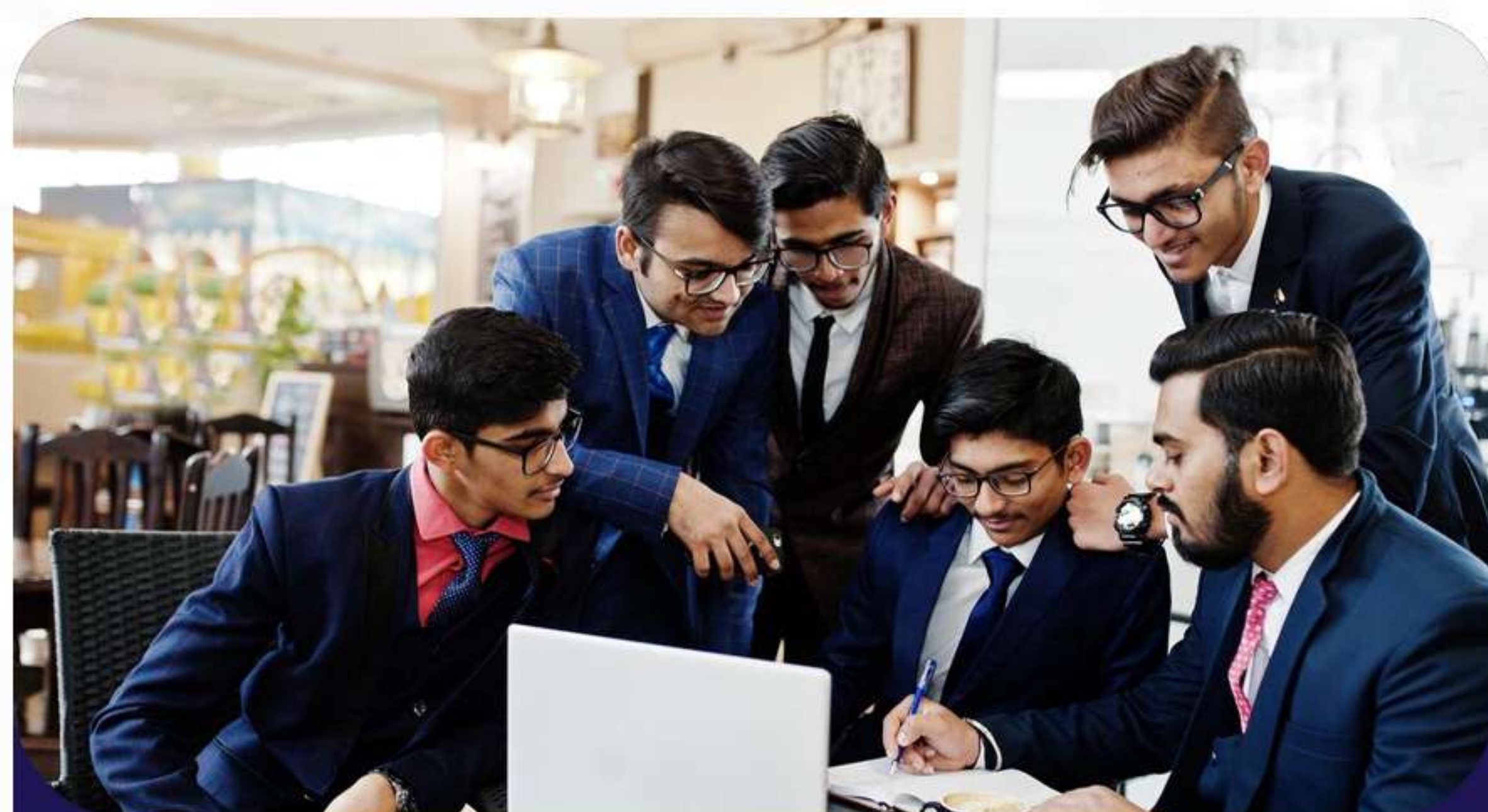
Soft Skill Program

Prepare for success beyond academia with our Soft Skill Program. Master essential communication, leadership, and teamwork skills essential for career advancement. Whether it's interviews, projects, or daily interactions, be ready to excel.