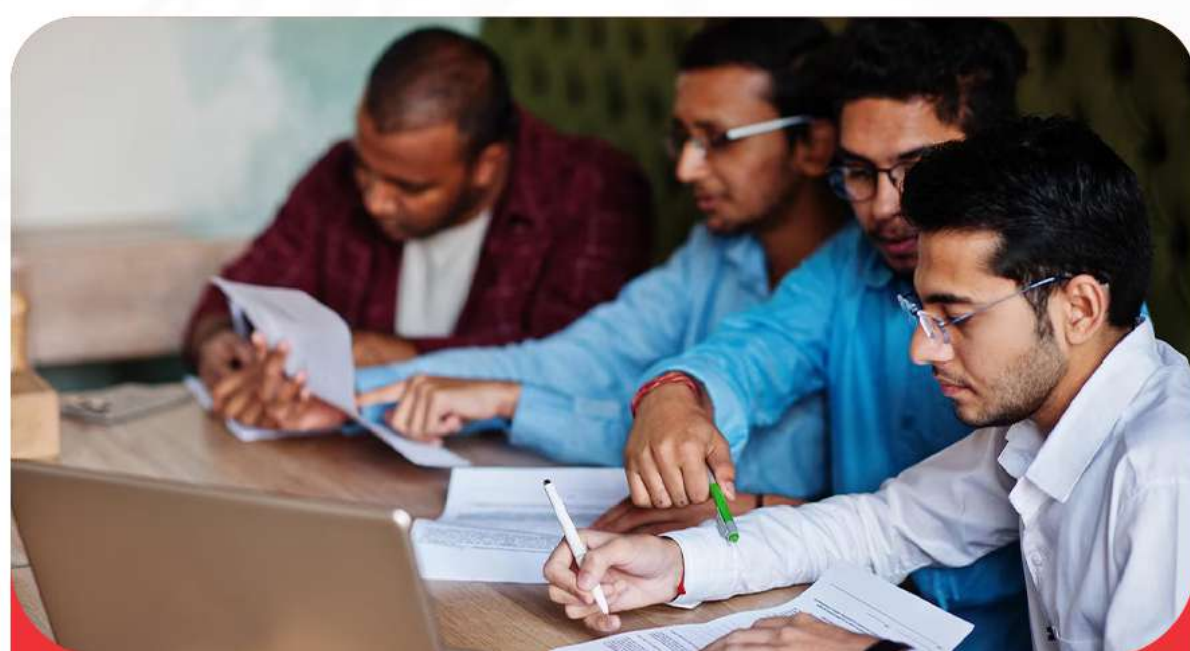
Personality Development Program

Our Personality Development Program can help you learn how powerful it is to know yourself and grow as a person. Learn more about what makes you special, work on your strengths, and turn your weaknesses into strengths. Develop a skilled image that makes you stand out in any business setting.